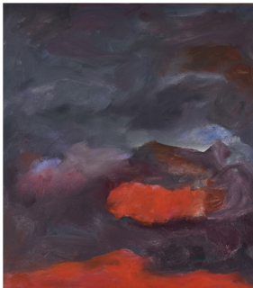
Red Sky Romasaig , 1988, 36 x 32 in/91.44 x 81 cm (o/c 1559)

The Caledonian Club, in London, in association with Waterhouse & Dodd will also have a Jon Schueler Show. Titled, Reflections on the Sound of Sleat , from Sept. 29-Oct. 28, 2022 at 9 Halkin Street, London SW1 7DR. Tel. 020 7235 5162. admin@caledonianclub.com