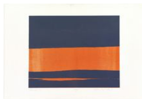
Red in a Night Sky, II 1971, (lith. 71-2)