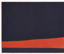
Red in a Night Sky, I 1971, (lith. 71-1)