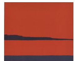
Red in a Night Sky, IV 1971, (lith. 71-4)