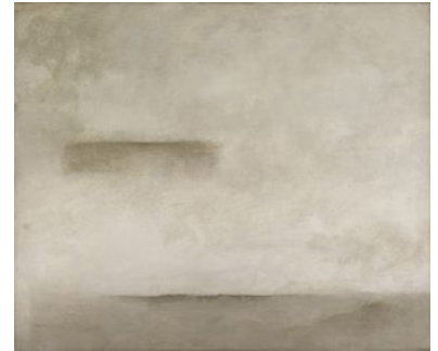
Light: Island and Sea, III, 1971 30 x 36 in/76.2 x 91.44 cm, (o/c 132)