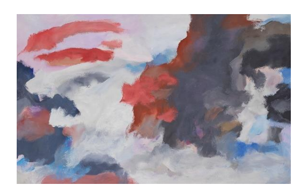
Lost Man Blues, 1988, 18x 16in (o/1549)