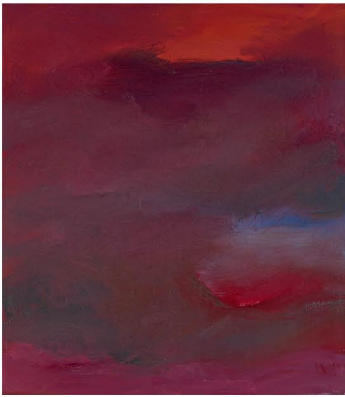
Lost Man Blues , 1988, 18" x 16" (o/c 1549)