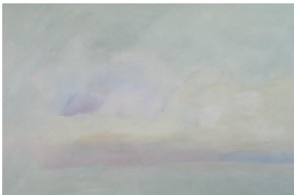
Rain Over Sleat Point , 1982, 32" x 48", oil on canvas (o/c 1282)

MOWA MUSEUM OF WISCONSIN ART West Bend, Wisconsin