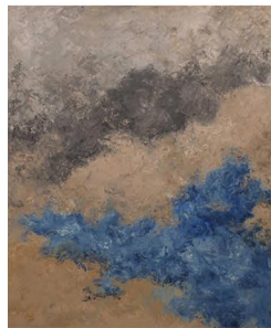
Left: Blue Horizon , 1955, 46 1/4" x 42", oil on canvas (o/c 55-12) Right: Grey Day , 1955, 34" x 28", oil on canvas (o/c 55-13)

UNIVERSITY OF WYOMING ART MUSEUM Laramie, Wyoming