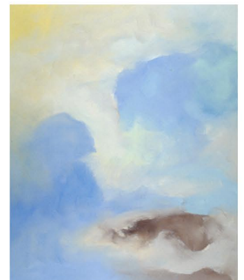
Raw Sunlit Blues , 1982, 60" x 50", oil on canvas (o/c 1256)

THE JON SCHUELER ESTATE Magda Salvesen, Curator, 40 W 22nd ST, 12TH FL, NEW YORK, NY 10010 phone: (212) 929-7614 email: msalvesen@jonschueler.com WWW.JONSCHUELER.COM