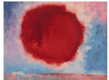
Sun , 1959, 20" x 26 1/4", oil on paper (o/p 59-10)