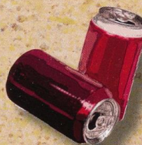
Aluminium Cans 50 Years