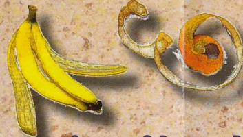
Orange & Banana Peels 2 to 5 weeks